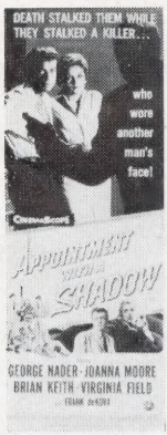
14 x 36